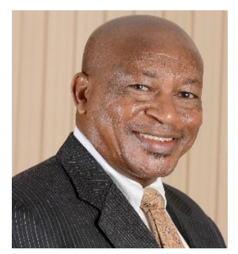
Hon. P. Kihara Kariuki C.B.S Attorney-General of the Republic of Kenya