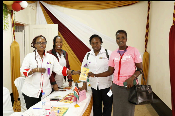
NACCSC members of staff manning their stand