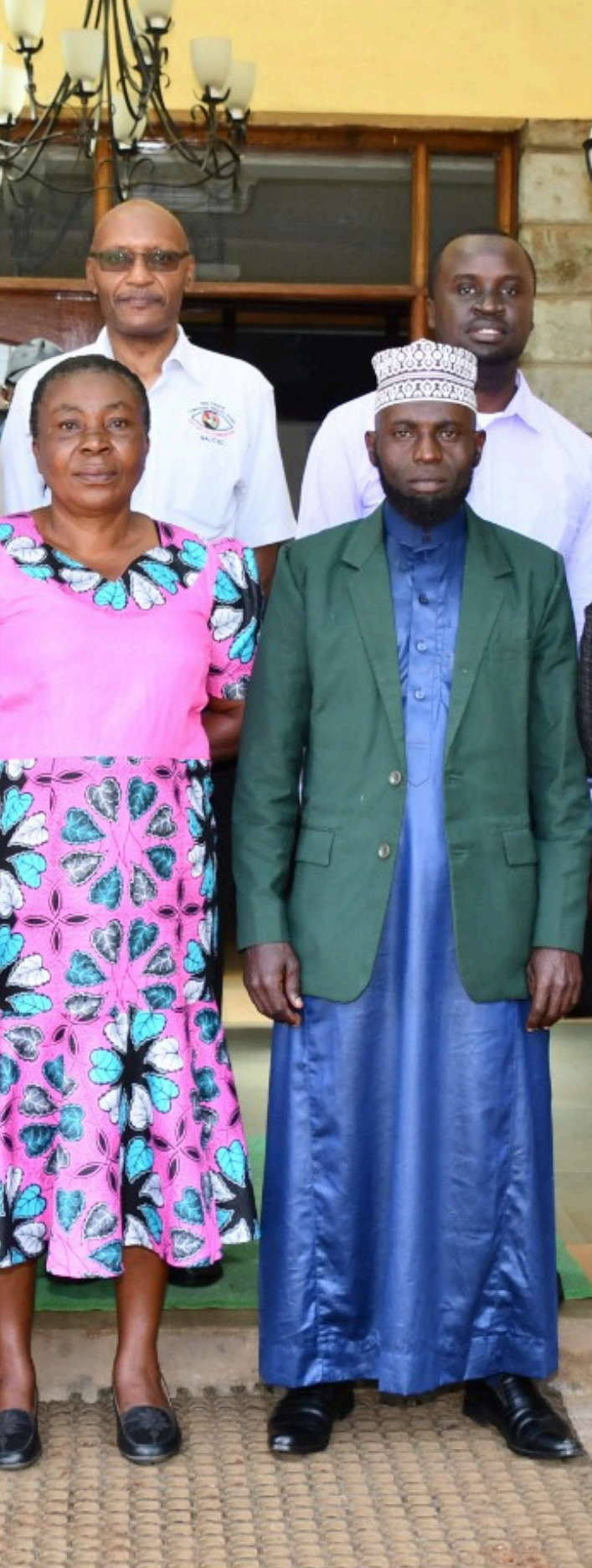
Vihiga CACCOC members during capacity building workshop in Kisumu.

Newly operationalized County Anti-Corruption Civilian Oversight Committees (CACCOCs) in Vihiga, Tharaka Nithi and Murang'a Counties members recently received training to equip them with the requisite skills and knowledge to carry out their duties.