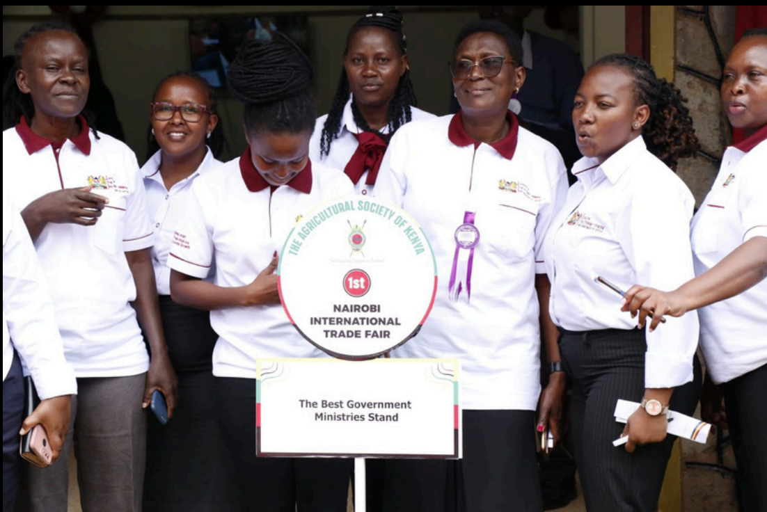
OAG & DOJ receiving the award for the best ministry stand