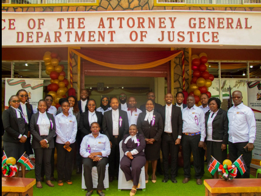
group photo of OAG & DOJ members of staff at the ASK