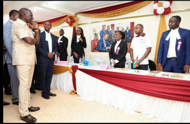
President Dr. William Ruto and the Hon AG Justin Muturi engaging with OAG & DOJ staff during the ASK