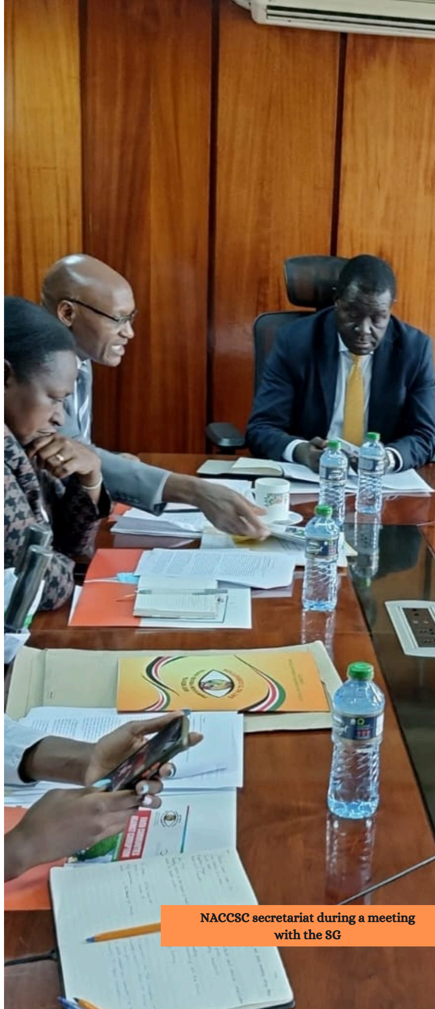
NACCSC secretariat during a meeting with the SG

He encouraged NACCSC to seek partnerships with the devolved units and other stakeholders and also ensure the CACCOs comprise of persons of integrity who are passionate about the fighting corruption.