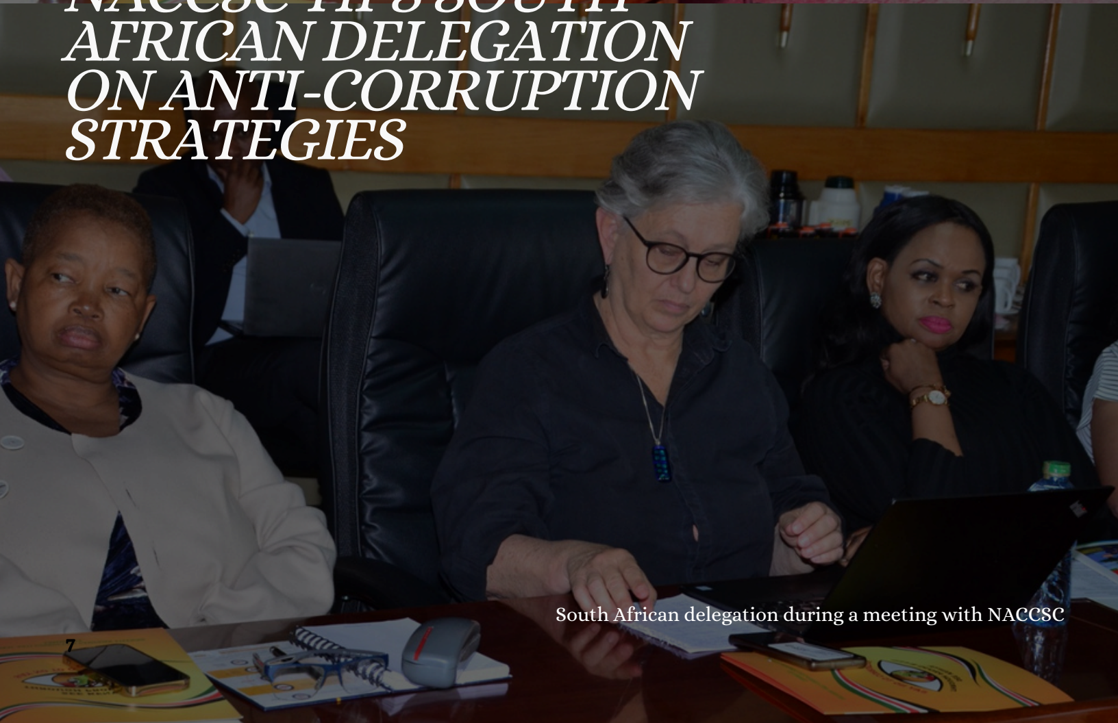
South African delegation during a meeting with NACCSC