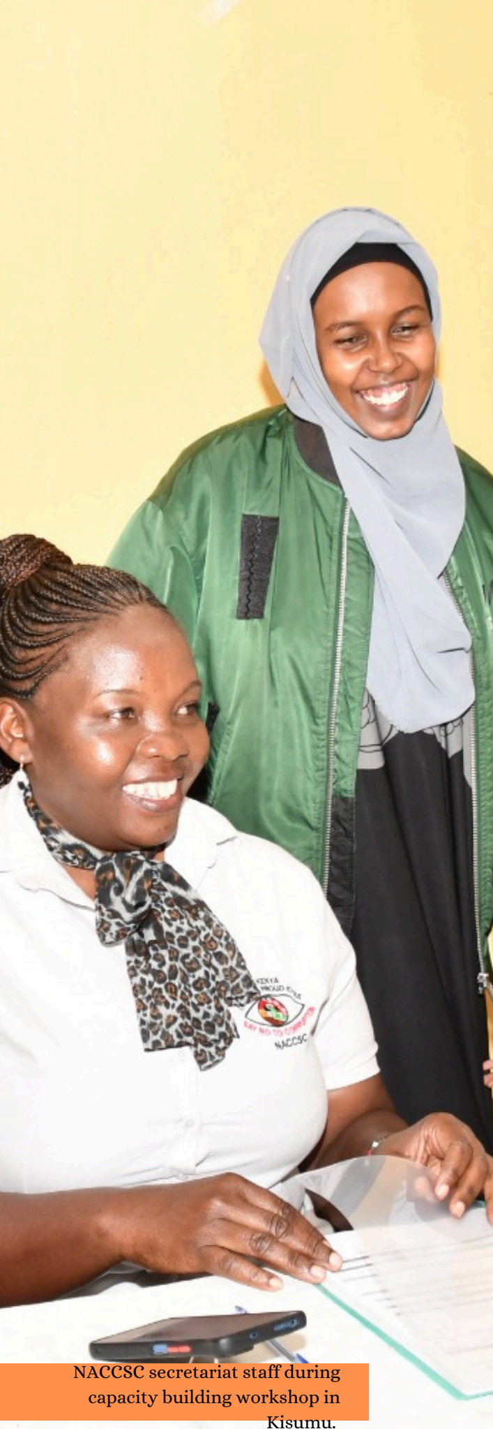
NACCSC secretariat staff during capacity building workshop in Kisumu.

Through sustained media public debates on corruption, the campaign has been instrumental in helping citizens clearly understand their role and the mechanisms for participating in the fight against corruption, the importance of policing resources through public participation in budgeting and implementation; and to demand for transparency, accountability and quality service.